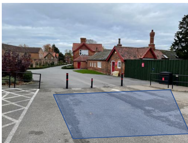
Assembly Point. Please assemble before the bollards.